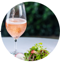
TABLE 26 ° PALM BEACH

They say it is one of the best restaurants in West Palm Beach, and to be honest that is hard to argue against.