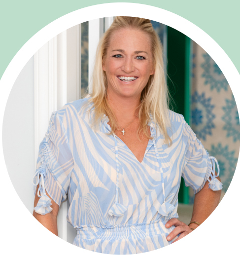
The Hotel Home Team